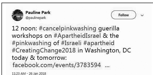
Messages like this one were posted on Twitter and Facebook, announcing unofficial sessions at the Creating Change Conference. (26 January, Twitter)

hallway of the Washington Marriott Wardman Park hotel. Queer anti-apartheid activists used Facebook, Twitter, and a website they created, www.cancelpinkwashing.com , to disseminate information about the protest workshops as well as a petition demanding that the national task force sever its long-term ties with Forever Tel Aviv, which hosts gay pride events in Israel as part of Israel's pinkwashing efforts to mask its continued violations of international law and human rights.