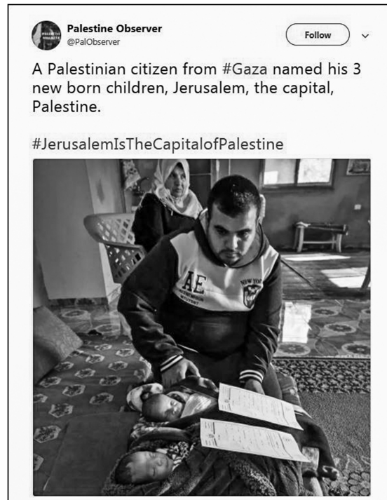
A man names his triplets after Jerusalem in protest of Trump's declaration.

Many ridiculed the U.S. decision, pointing out the flawed logic of Trump's reasoning, which they traced back to nearly a century of U.S. support for the Zionist settler-colonial project. Many social media users sought to make that history clear to readers around the world, and took aim at the racist undercurrents inherent to Zionism. Others chose to highlight the centuries-long harmonious history of Jerusalem, which has been eviscerated by Israeli policies.