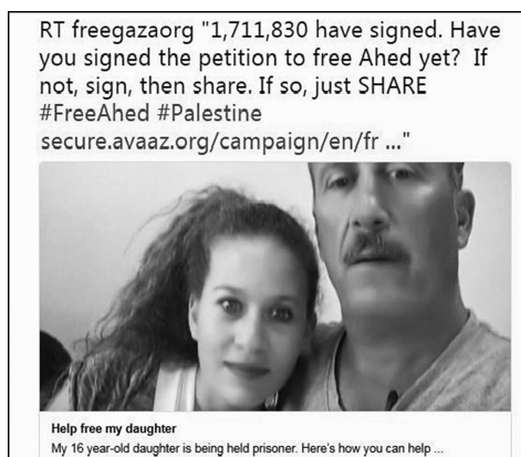
A petition purportedly garnering nearly two million signers made its round on social media. (February 2018, Twitter)

Irish artist Jim FitzPatrick, the creator of the iconic 1967 image of Che Guevara, took the plaudits one step further by creating an image in which Ahed is transformed into the "real Wonder Woman." Observers noted that the portrayal was likely a swipe at Israeli actress Gal Gadot, who was cast as the comic book character in a feature film in 2017, a decision widely criticized because of Gadot's support for Israel's military and its occupation of the Palestinian territories.