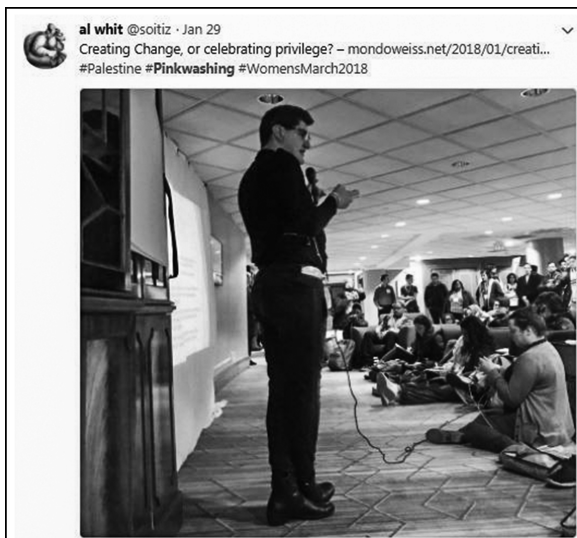
Activists gather in a hallway at the Washington Marriott Wardman Park hotel for a guerrilla session on Palestine.