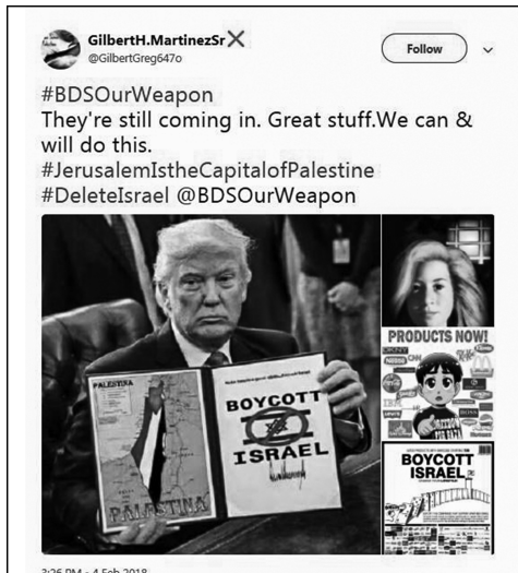
A humorous social media post about Trump's Jerusalem declaration. (Twitter)