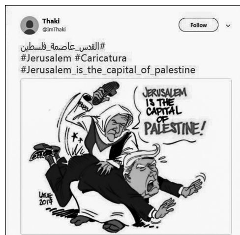
Social media users turn anger over Trump's plans into jokes.