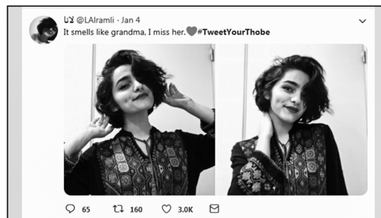
A Twitter user shares a photograph of her grandmother's thobe. (4 January, Twitter)