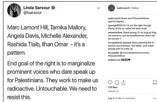
Linda Sarsour sends a message of resistance against the suppression of pro-Palestinian voices. (12 February, Instagram)

Part of the youngest, most diverse, and solidly progressive group of women politicians to enter the U.S. House of Representatives, Omar and her fellow Muslim congresswoman, Rashida Tlaib (D-MI), were dragged into several controversies on the topic of Israel almost immediately after their investiture on 3 January. One such furor broke out over a six-word (plus one music-note emoji) tweet posted by Omar in response to a comment by House Minority Leader Kevin McCarthy (R-CA) attributing Omar and Tlaib’s stance on the Boycott, Divestment and Sanctions (BDS) movement to anti-Semitism and alleged links to white supremacy. In her tweet, Omar retorted, “It’s all about the Benjamins baby”—a lyric from U.S. hip-hop artist Sean “Diddy” Combs’s 1997 ode to money and a rebuke to fellow legislators and politicians whose positions on BDS are largely shaped by their connections with the powerful pro-Israel lobbying group American Israel Public Affairs Committee (AIPAC).