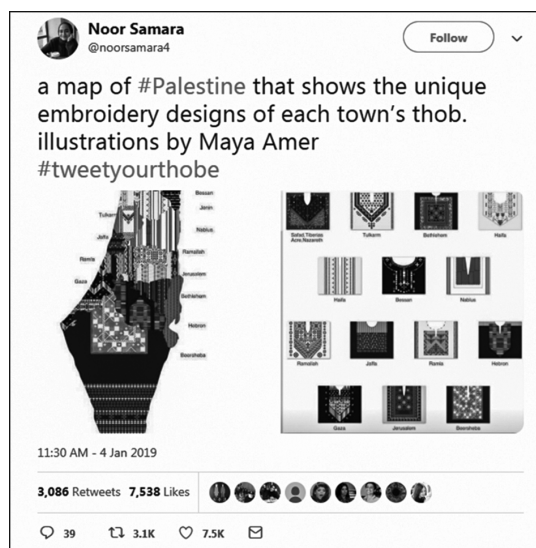
A map depicting thobe patterns unique to different regions of Palestine. (4 January, Twitter)

A thobe is a traditional embroidered Palestinian gown, often passed down from mothers to daughters, which is worn on special occasions, both joyous and somber. The embroidery