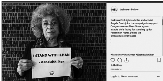
Activist Angela Davis displays her support for Minnesota congresswoman Ilhan Omar. (February 14, Twitter)

In February 2019, notable progressive U.S. figures, including Women’s March organizers Linda Sarsour and Tamika Mallory, civil rights icon Angela Davis, and performer/activist Harry Belafonte, joined tens of thousands of people in expressing enthusiastic support for Ilhan Omar (D-MN), the newly elected Democratic representative from Minnesota.