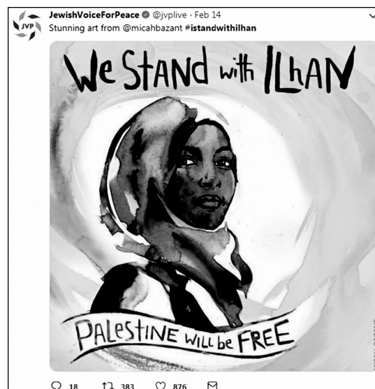
Jewish Voice for Peace tweets an illustration of Ilhan Omar in support of the congresswoman. (14 February, Twitter)