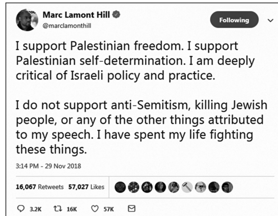
Marc Lamont Hill defends his position. (29 November, Twitter)

The many critics of CNN’s decision used the hashtag #IStandWithMLH to voice support for Hill and to ask why his call for basic human rights in Palestine was considered controversial enough to terminate his employment with the network, pointing out that former Pennsylvania senator Rick Santorum, who has point-blank denied the existence of a Palestinian people, has